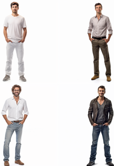
Fig 4: Example AI boyfriend images

The image generation and restaurant recommendation algorithm did not improve or change much objectively. They both performed similarly as I was not able to update the process. Midjourney created great images, but the effects were limited then began to backfire as only the men who were smart enough to tell it was an AI image and desperate enough to message me anyway contacted me. They were the most annoying. Additionally, when my parents, family, and friends realized what I was doing, they all interpreted the AI boyfriends as desperation and began trying to set me up even more than they were before. Example images can be seen below generated from my preferences. I think they turned out pretty great. If anything, they set the bar for everyone else!