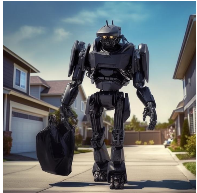
Fig 3: CHAD-Bot Taking out the Trash

So, I know, a house chore robot isn't exactly a generative AI. I'm still working on the bot autonomy, but I have equipped CHAD-Bot with ChadGPT, a behavioral learning algorithm, and the same Genetic algorithm that Santa Clause uses to path plan multiple tasks on Christmas [16]. CHAD-Bot, as shown in the figure below, will accomplish all the heavy-duty physical tasks around the house I don't have anyone around to task. With the conversations from my Ex regarding chores leading to huge arguments, it will be simple to train him to do it all from scratch. With all of these methodologies in place, there is nearly zero reason to ever have a boyfriend.