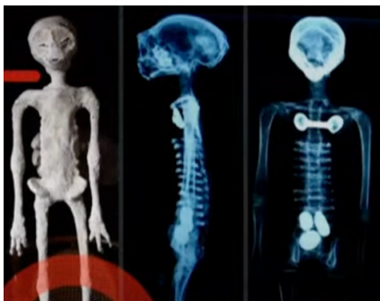
Figure 3: Scan of an infertile alien with only three eggs [3]

If a species were to be able to sustainably reproduce and populate an entire planet, it would need way more than three eggs. The species that colonize planets the best will produce at least dozens of eggs while the superior species releases thousands of spores into the air during mating season. If this is an extra-terrestrial alien, it is a sorry excuse for one.