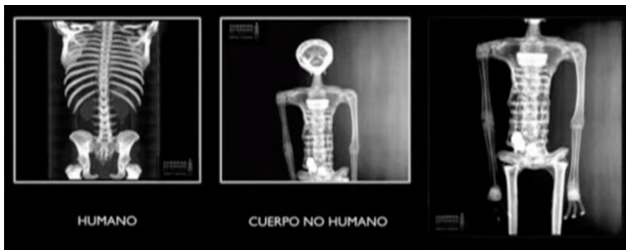
Figure 2: Human rib cage vs the alleged “aliens” [3]

In a normal species, their rib cages do not connect at the center. This allows for creatures to have working lungs which can expand and contract. In the discovered specimen, each rib connects at the center and to my knowledge, the human race has not evolved to breath like an accordion yet, or to integrate an electronic filter which increases resistance to toxic gasses from space and gaseous nebulae.