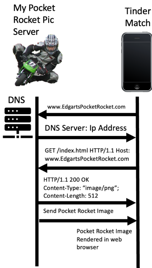
Figure 4: Pocket Rocket HTTP Methodology

By setting up my own image hosting website at http://www.EdgartsPocketRocket.com , I can send an appropriate link address to my match so that they can use HTTP [7] to access my Pocket Rocket images. As shown in the figure below, by opening the link in a web browser, my tinder match will receive an IP address from a Domain Name Server (DNS) and then send a GET command to my website server's correct IP address. From there, the server will respond with the appropriate requested image using a POST command.