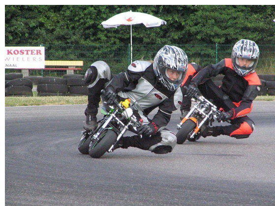
Figure 1: Me racing on one of my awesome Pocket Rockets

humming pocket rocket between their legs on a mild spring day at the track. I'm not bad looking and I have a good job, so I don't have trouble getting matches, but as soon as I ask these women if they'd like a picture of my pocket rocket, I just get unmatched or never hear from them again. Dating has really changed a lot in the last 15 years. I could just never bring it up, but I have about a dozen pocket rockets in my garage, it's kind of part of who I am!